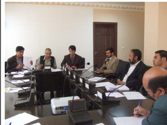
The PSDD team in a meeting with key private sector development stakeholders in the Afghanistan National Chamber of Commerce and Industry (ANCCI) in Herat city