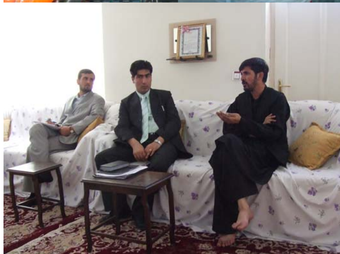
The Pamir Zam-Zam Company's Beverage/Bottling Plant in the Herat Industrial Park. The owner has installed a quality-control laboratory equipped with relatively expensive instruments but, in the absence of a government attestation/quality-control system, sees limited benefits in having done so