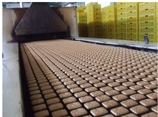
Biscuit producing/packaging unit at the Herat Industrial Park

The PSDD, through the ground-breaking work that the Provincial Project is undertaking, is currently exploring possibilities to assist provinces in the preparation of economic growth strategies. Discussions are under way in Kabul and in the Provinces (through the PSDD visits) with relevant stakeholders, and areas are being identified, such as technical assistance and training for provincial directorates, where the PSDD can help. This work, along with the need to engage more strongly with the provinces, necessitates a permanent staff presence in the Provinces and the Directorate will actively pursue and meet this need in 2008.