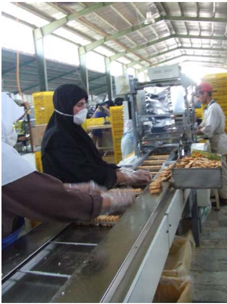
The Provincial Economic Development Project team in Herat Industrial Park.